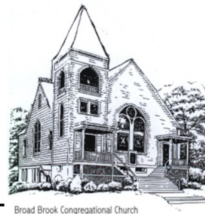
Broad Brook Congregational Church

122 Main Street Broad Brook, CT 06016 860-623-4547