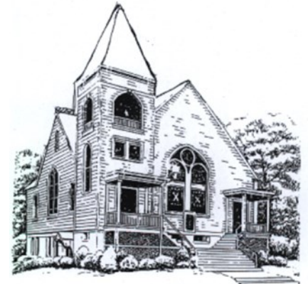
Broad Brook Congregational Church

122 Main Street Broad Brook, CT 06016 860-623-4547