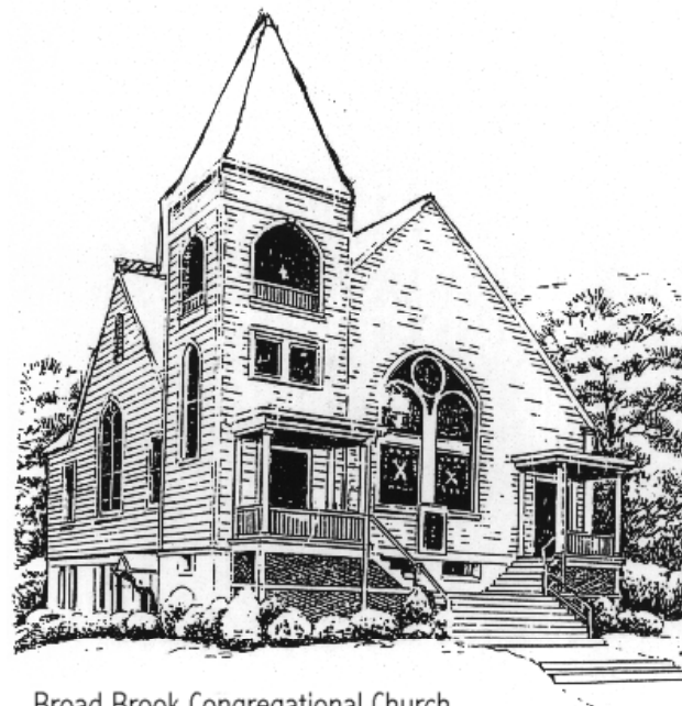
Broad Brook Congregational Church