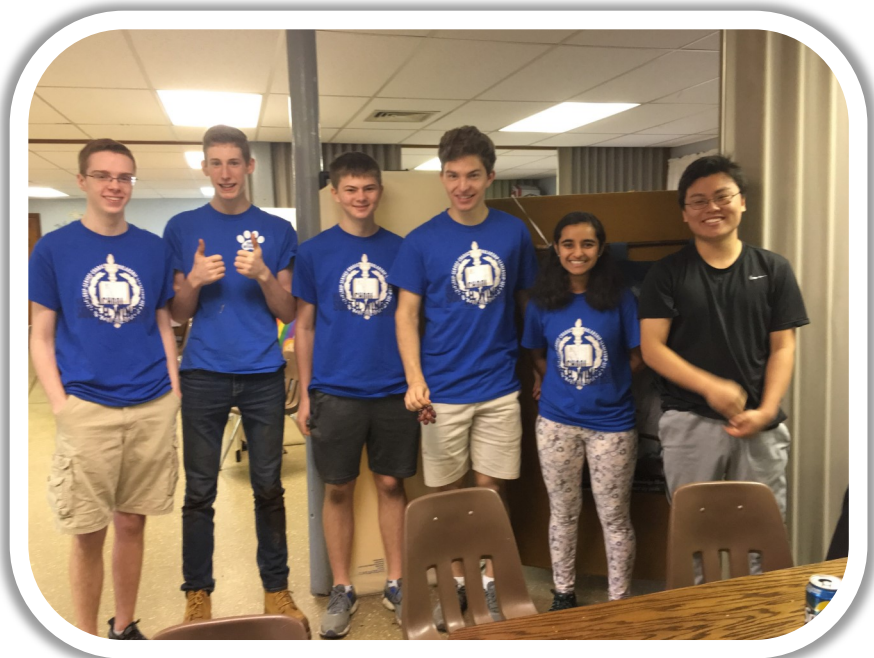
Thanks to our teen volunteers for Clean Up Day!