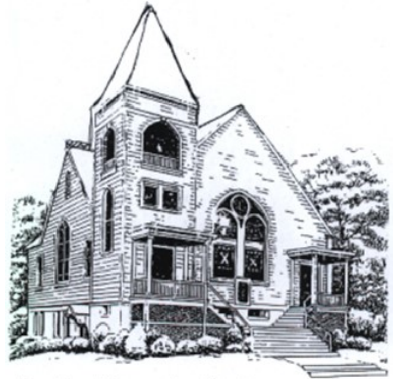
Broad Brook Congregational Church