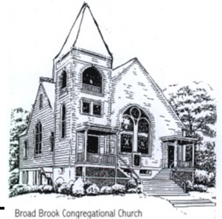
Broad Brook Congregational Church

122 Main Street Broad Brook, CT 06016 860-623-4547