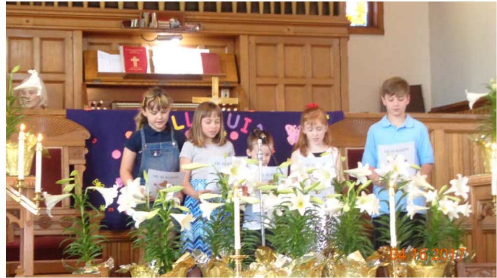
Children singing "He is Risen" on Easter Sunday during worship service.

The Ecumenical Bazaar is being hosted by BBCC this year. The date is Saturday November 11th. I will keep you informed on our progress as we set things in motion. But for now..... the hall has been rented so the date has been sent. We have received the information Manual we share as we take turns hosting. We are requesting some new homemade items to be donated for the sale. It is never too early to start crafting so we are not last minute sam's!!! We tend to add stress to ourselves in waiting too long! More info to follow in the next issue of the Beacon as we progress.